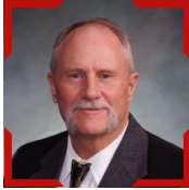
SENATOR LARRY HICKS - DISTRICT 11