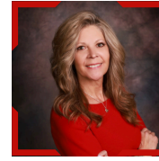
SENATOR STACY JONES - DISTRICT 13