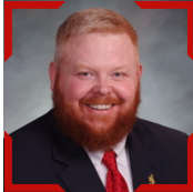
REPRESENTATIVE CODY WYLIE - DISTRICT 39