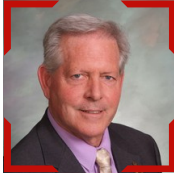
SENATOR JOHN KOLB - DISTRICT 12