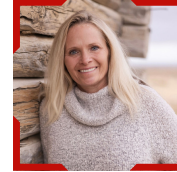
SENATOR LAURA PEARSON - DISTRICT 14